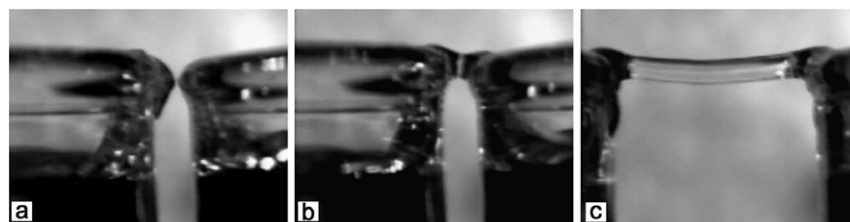
Figure 1. Water bridge formation: (a) rise of water in both beakers after a high voltage was applied and a first ignition spark was observed, (b) spontaneous formation of a connection which remains stable after (c) pulling the beakers apart.